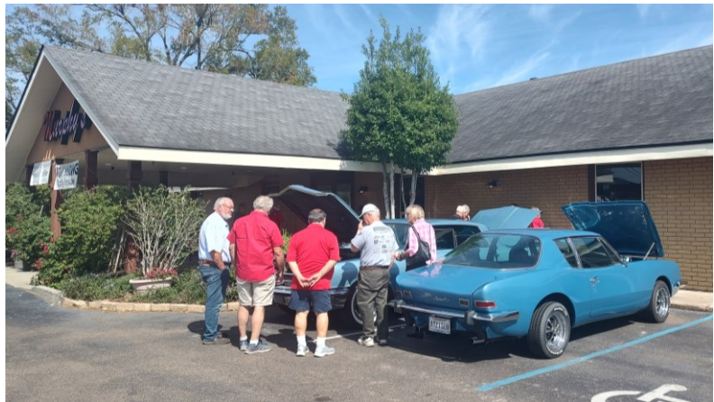
Everyone Enjoyed Visiting After the Meeting