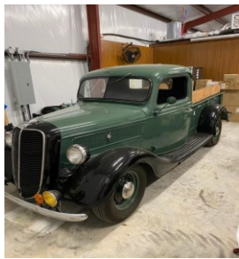
1937 Ford Pickup