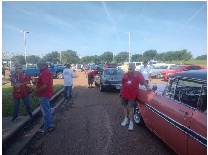
Horseless Carriage Club, Kar Kapers